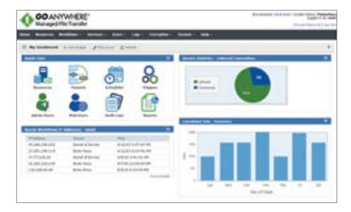
Modern Browser-Based Dashboard for Administration