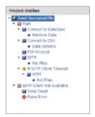
Over 60 Unique Tasks